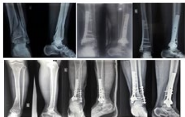
Figure 2: Preoperative, post-operative and post-union radiography of above and Group B patients below.

One patient in Group A showed delayed union at 9 months and autologous iliac crest grafting was done.